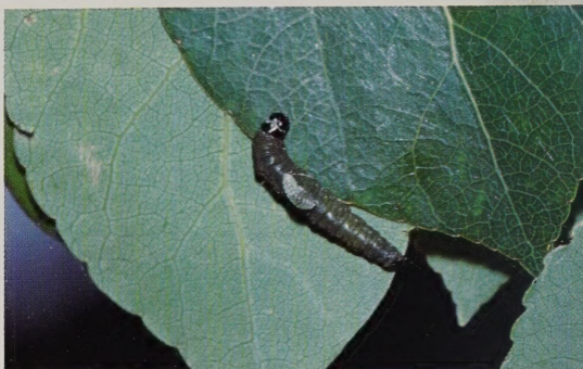
Figure 5. Parasitized tortrix larva.